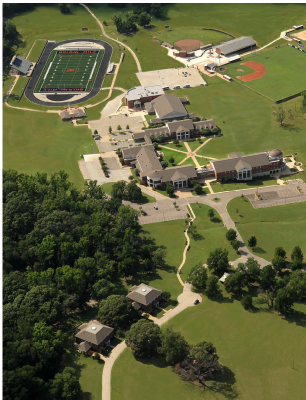
THE BROOK HILL SCHOOL

Bullard experiences a humid subtropical climate, with hot summers and mild winters. Average high temperatures range from 58°F (14°C) in January to 94°F (34°C) in August. The area receives around 46 inches (1,170 mm) of rainfall annually, with May typically the wettest month.