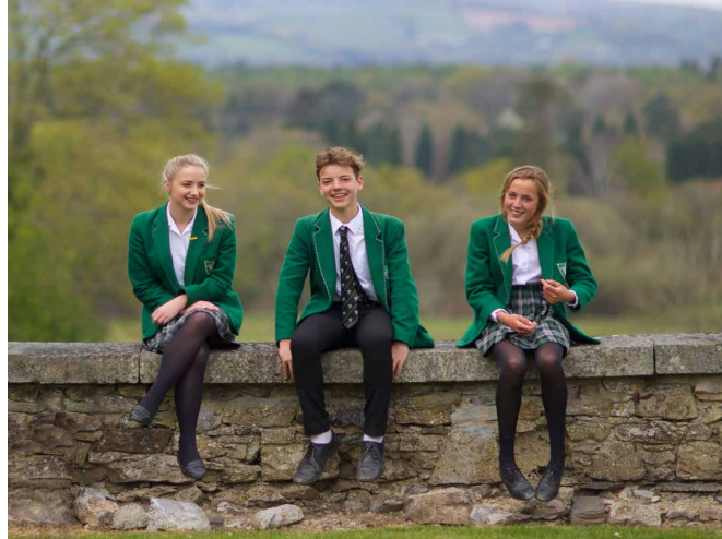
Where is Stover School?

A broad and balanced curriculum is provided for all age ranges and the school aims to work to the strengths and talents of individual students. A dedicated team of teaching and pastoral care staff provides encouragement, motivation and support to enable pupils to achieve academically and also in music, drama, the arts and sport. As a relatively small school, the reduced class sizes allow teachers at Stover to get to know every pupil very well and take a personalised approach to their learning. The school's house system provides a framework for pupils to develop a sense of collectiveness within a supportive and caring environment.