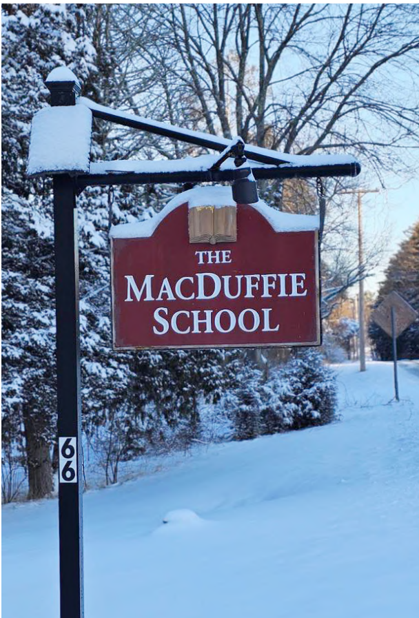
THE MACDUFFIE SCHOOL

Four-season climate with cold winters and mild to warm summers.